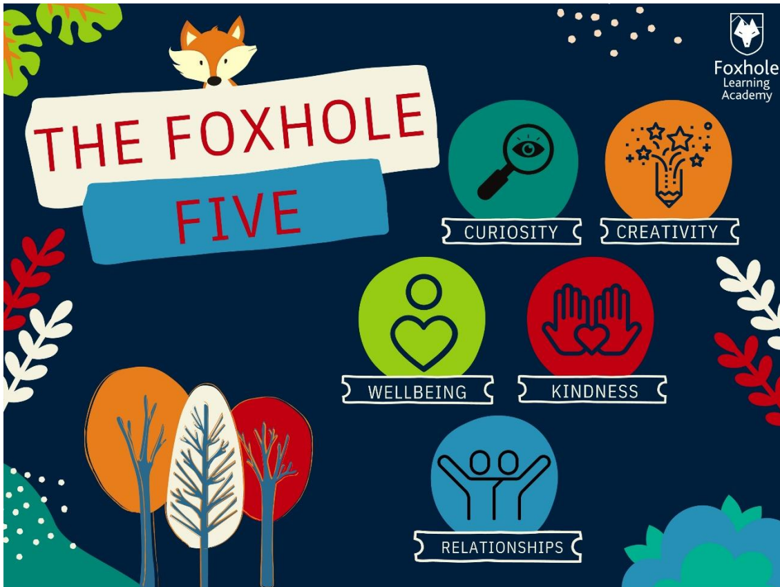
Our School Values 'The Foxhole Five'

At Foxhole Learning Academy our aim is to develop children as confident, happy citizens, providing them with the tools and skills to succeed in life, whilst empowering them to embrace their beliefs and understanding of others. We aim for all children to develop in all areas of Spiritual, Moral, Social and Cultural (SMSC) until they are ready to leave our school and continue their journey of education into KS3.